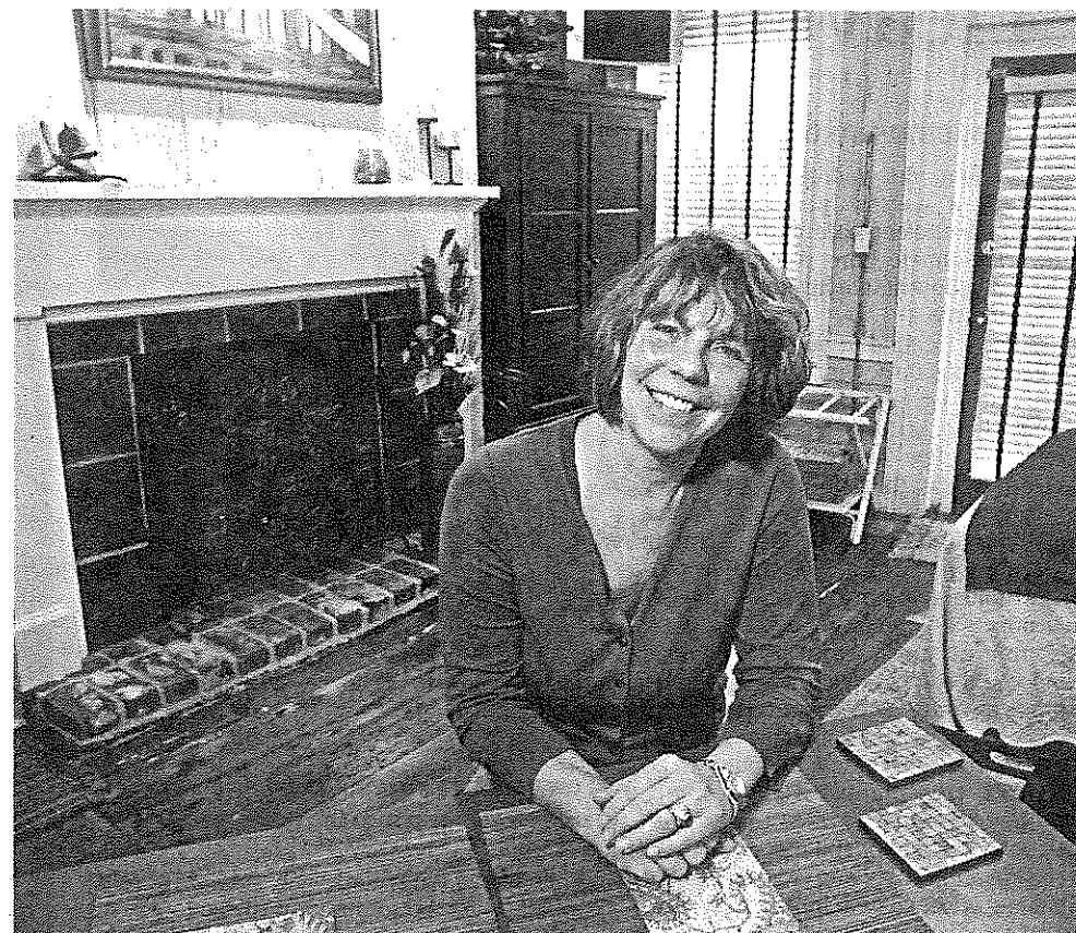
Travis Bell for The New York Times