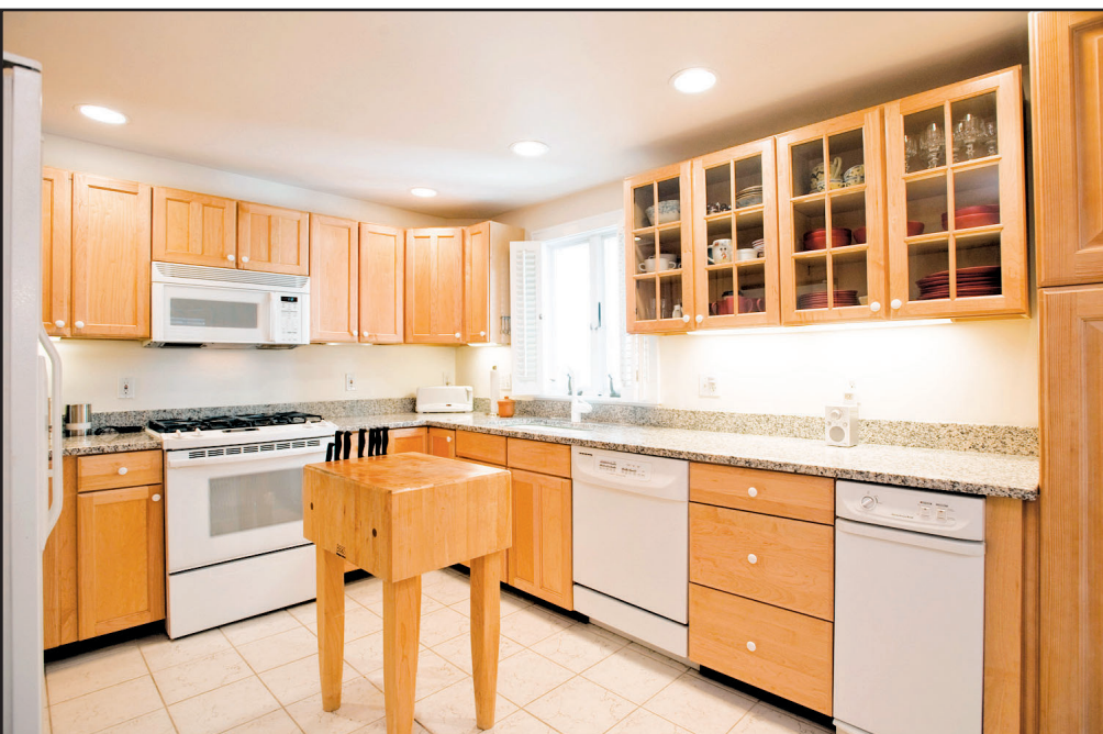
The kitchen features granite counters, KitchenAid appliances, including a gas range, and Scavolini kitchen cabinets.

A deeded parking space is available for $100,000.