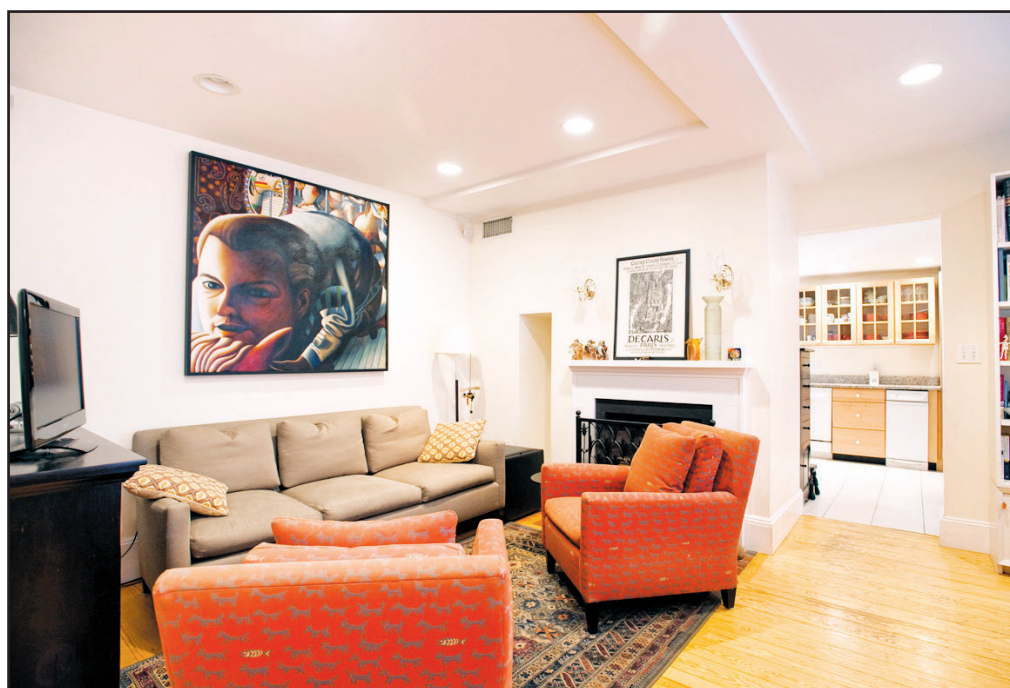
A dining area has been created in the spacious living room where a long window seat in front of a picture window looks out onto the lane.

staircase leads to the upper floors, and down the hall, stairs descend to the family room and the utility room. To the right from the front door a wide doorway opens to the living room.