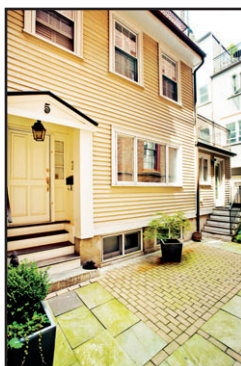
This North End single-family clapboard-sided house at 5 Tileston Pl. is accessed by a walkway off Tileston Street.

Through the front door a shallow storage closet gives space to hang coats. Beyond it a